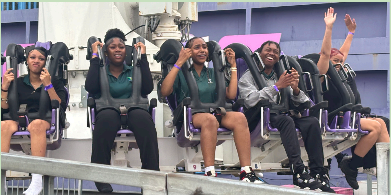
Students get ready for launch on funfair ride

"I think the Whole School Trips reward is a good thing because it lets you blow off steam at the end of a hard academic year."