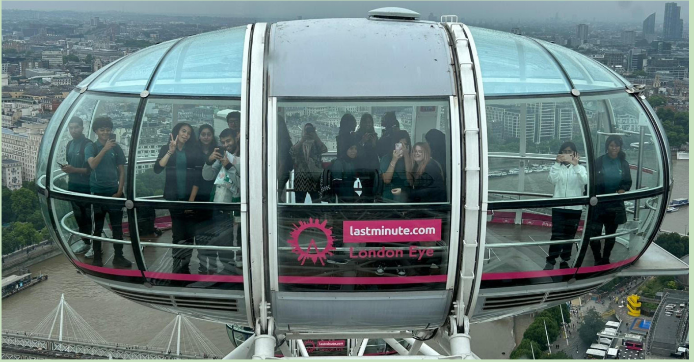
Students enjoying a spin on the London Eye