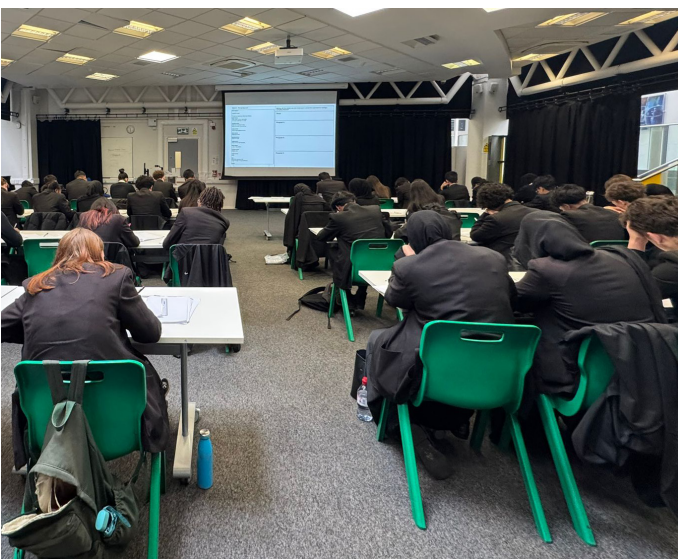
Year 11 students getting some last-minute prep for their GCSE exams.