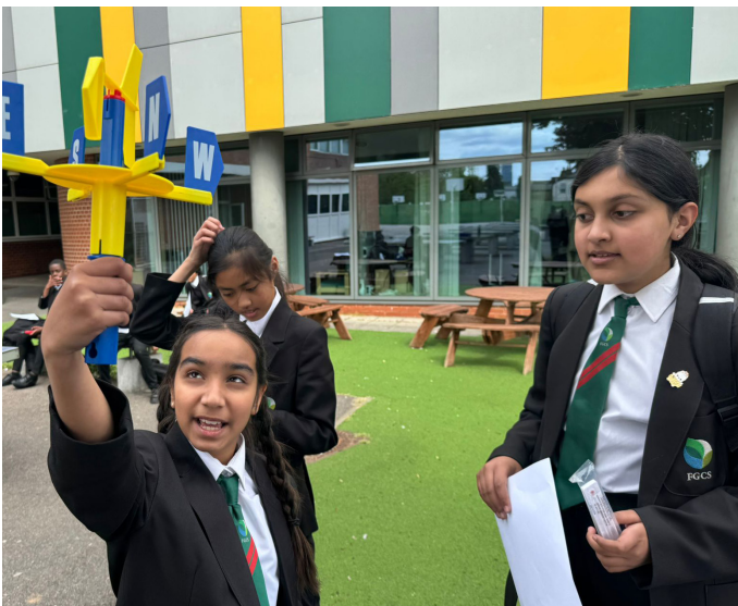
Year 7 conducting a micro climate investigation as part of their geography class.